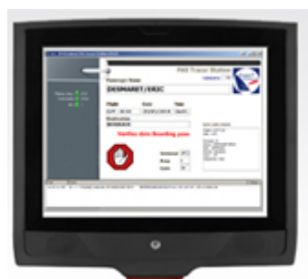
Integrated Bar Code Reader

It is then stored in PAXTracer database.