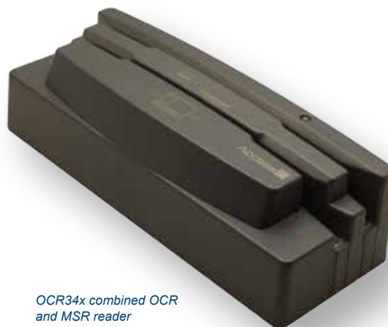
OCR34x combined OCR and MSR reader