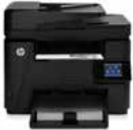
(HP LaserJet Pro MFP M225dw)