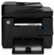
(HP LaserJet Pro MFP M225dn)

This powerful MFP increases productivity with automatic two-sided printing, an intuitive touchscreen with scan-to options, easy wireless connectivity, 1 built-in networking, security features, and mobile printing options. 8